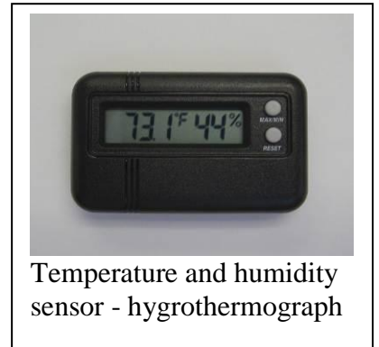
Temperature and humidity sensor - hygromograph

Inexpensive humidity sensors can be purchased from archival materials suppliers for around $25.