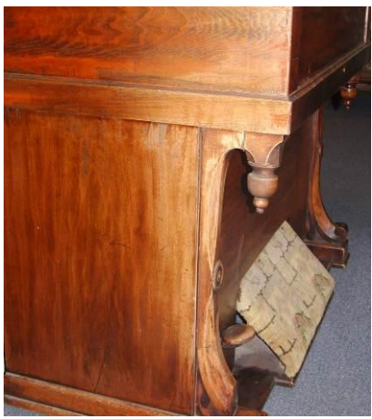
Faded edge of a melodion that stood next to a glass sliding door before being donated to PCMC.

Most of the time light damage takes the form of discoloration. It can bleach the wood, affect the coating and degrade the upholstery. It can accelerate the aging process and cause the surface to become brittle and unstable. Unfortunately, light damage is permanent. To reduce the risk, keep your wooden objects away from large windows and bright lights. Use window shades and curtains and cover furniture when not in use.