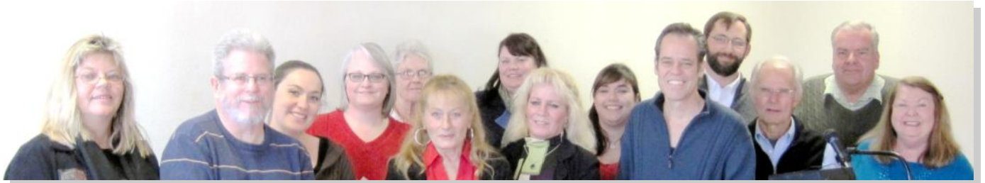
New recruits receive their certificate of completion at the 2013 Christmas Luncheon

and are invited to return every year for a refresher course. During those weeks new recruits will have considered how Placer County Museums needs their help and the areas that most interest them. They