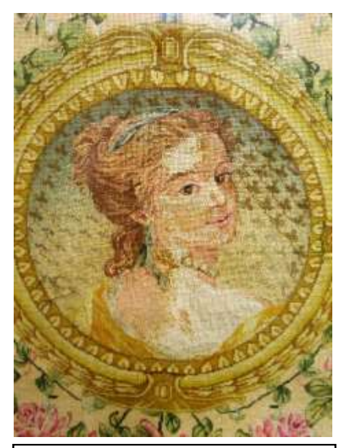
27"x 36" Tapestry from the Merci Train, depicting Comtesse Du Barry, courtier and mistress of King Louis XV. (pre-beheading)

by Kasia Woroniecka Curator of Collections