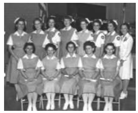
1945 nursing class at DeWitt Hospital.

of The Placer, we'll highlight both – sometimes in the same article. If you have any questions about our two big museum projects (the Gold Rush Museum and the new DeWitt History Museum), please don't hesitate to stop by my office in the historic Courthouse.